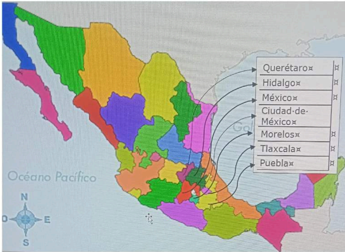
Figure 1: Geographic location of the region under study in the Mexican Republic

statistical data to facilitate the explanation of the problematic core.