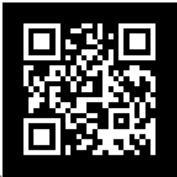
Figure 1: Figure 1 :

244 Media control and propaganda always put strain over information broadcast, especially when it is related to war 245 and conflict. Therefore, data collection from media source become a limitation for any researcher. However, the present analysis mostly uses statements from 1 2