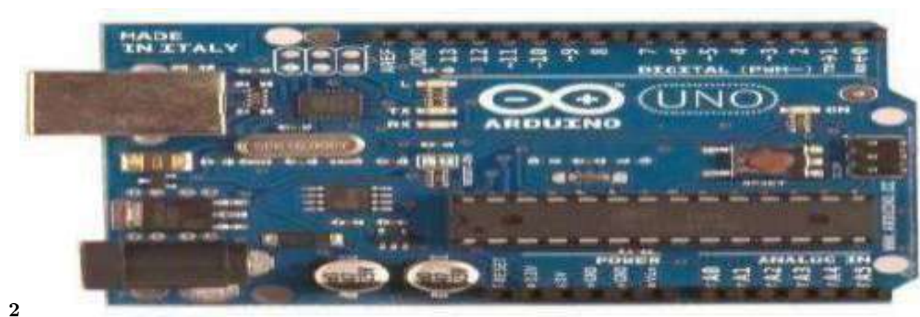
Figure 3: Fig. 2 :