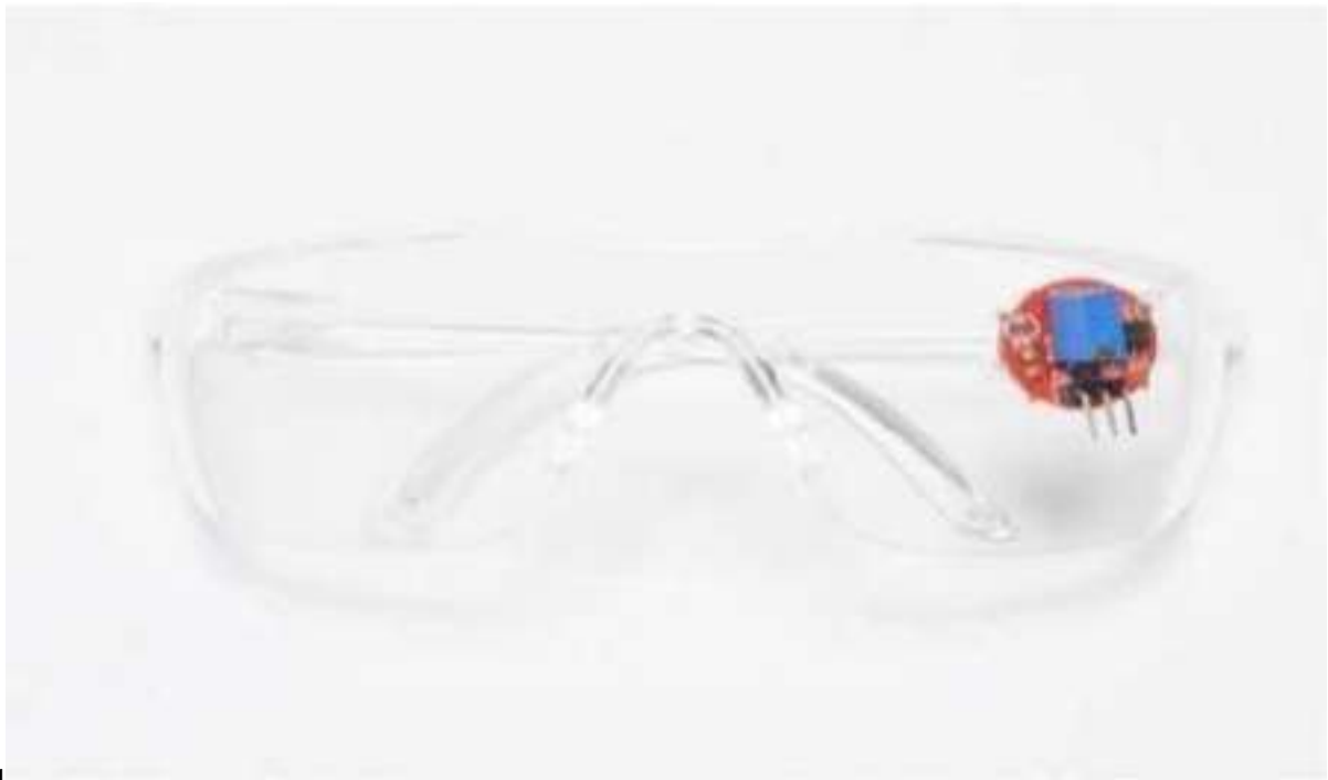
Figure 5: Fig. 4 :