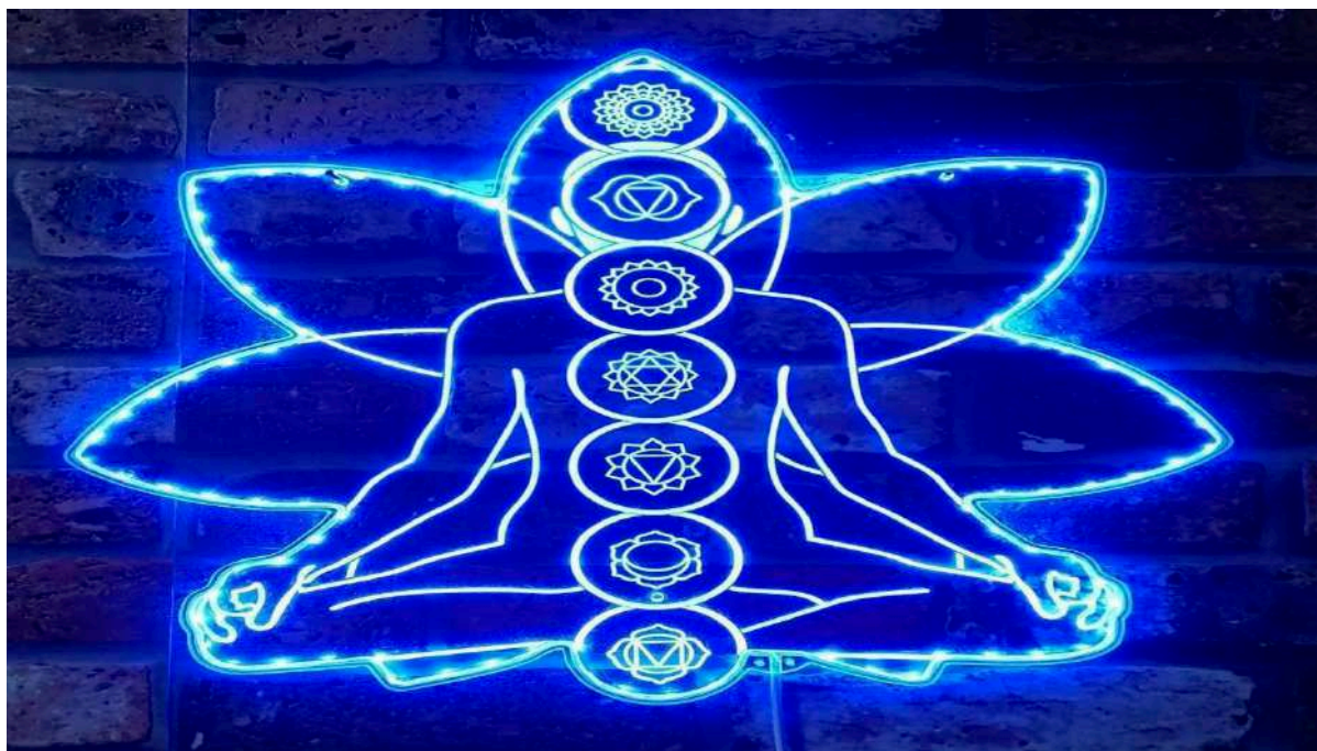
Fig. 2: The Chakra Symbol